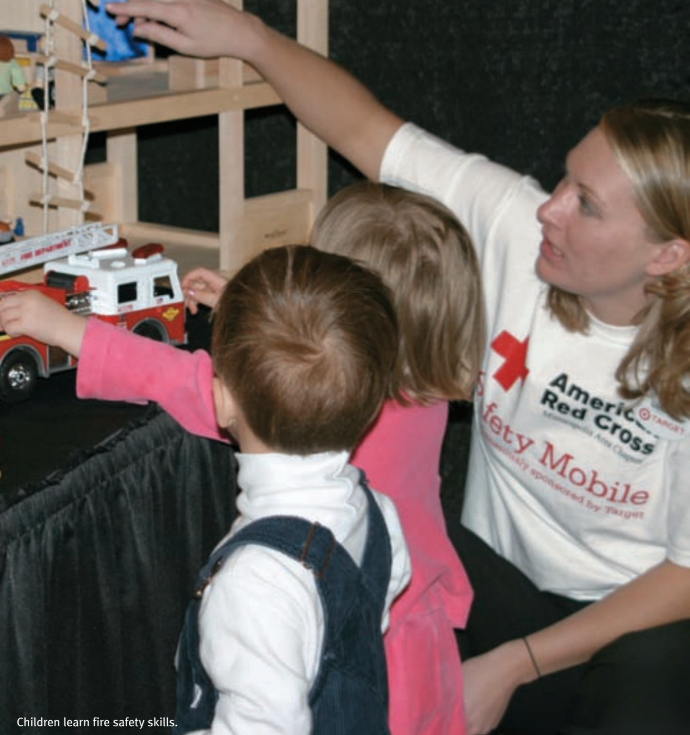
Children learn fire safety skills.