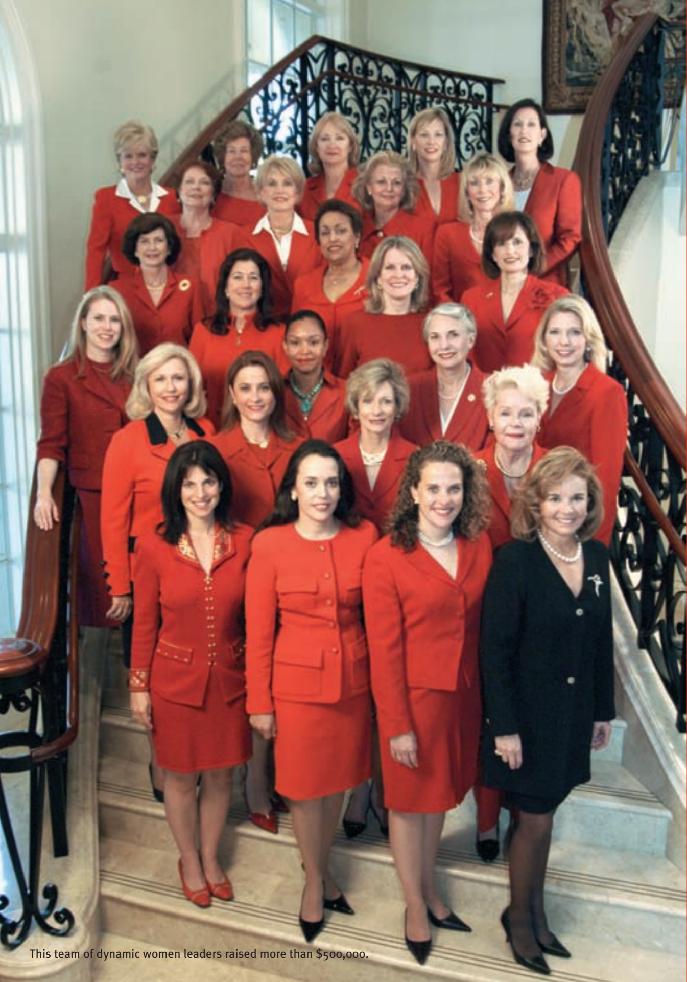
This team of dynamic women leaders raised more than $500,000.