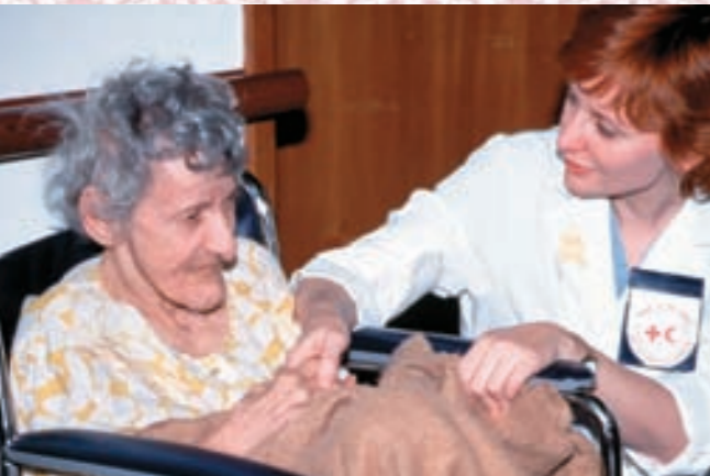
Taking care of the most vulnerable.