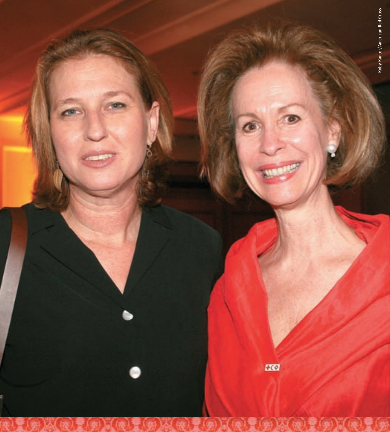
Koby Kantor/American Red Cross