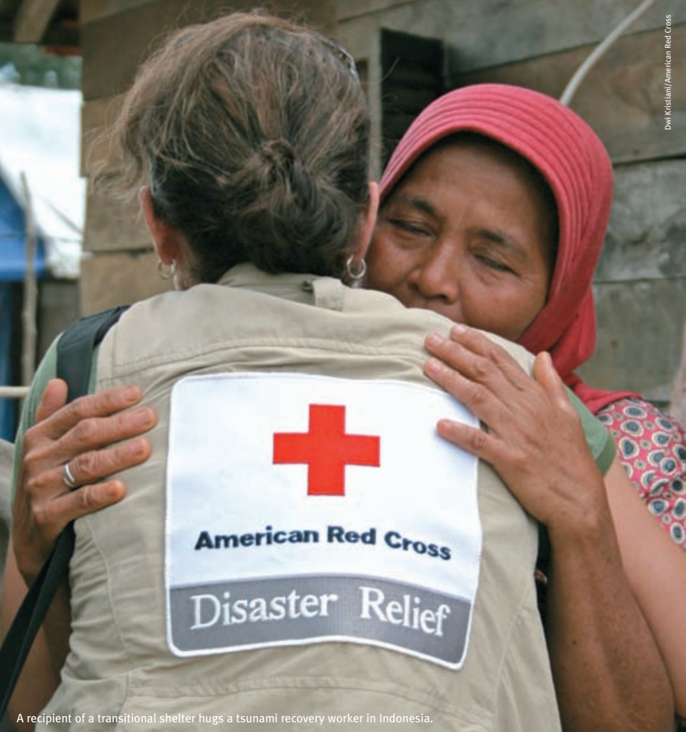
A recipient of a transitional shelter hugs a tsunami recovery worker in Indonesia.