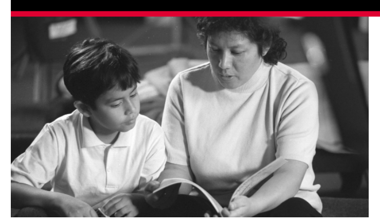
Children need to know their family members' phone numbers and e-mail addresses. The information should be carried with them to school and easy for them to find at home.