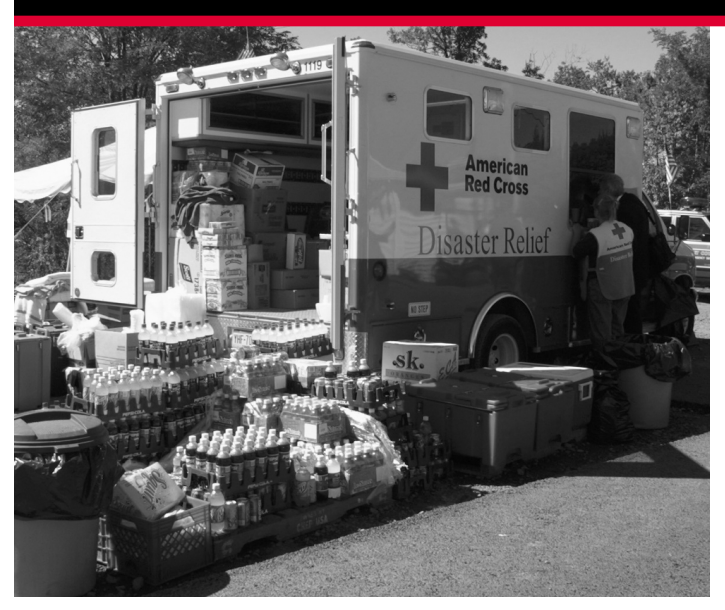
Supplies for rescue workers are unpacked at the Pennsylvania crash site on Sept. 13. The Red Cross can provide necessities very quickly to almost any location for as long as they are needed.