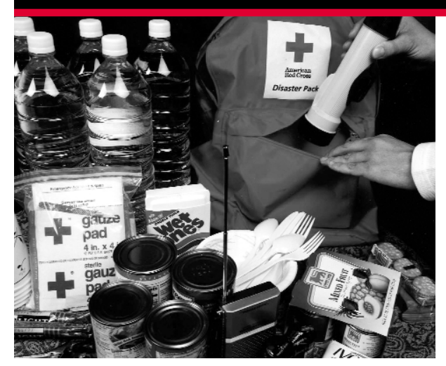
A disaster supply kit, with items like those shown and a radio and extra batteries, is an essential resource in times of emergency.